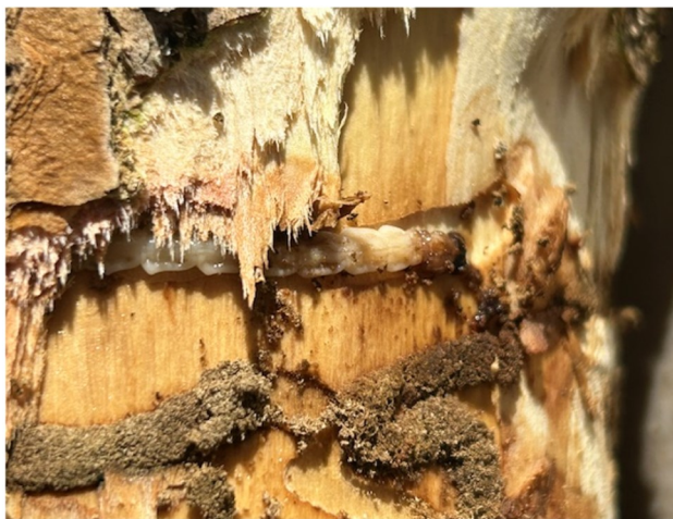
Ash Borer Larvae