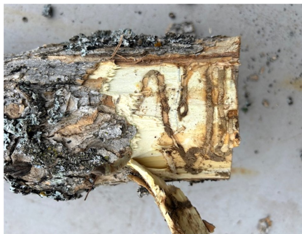
Channels under the bark