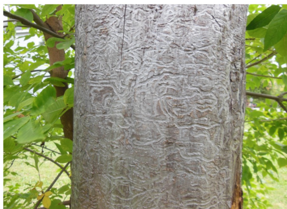
Dead Ash Tree

The beetle infestation is expected to eventually elimi-