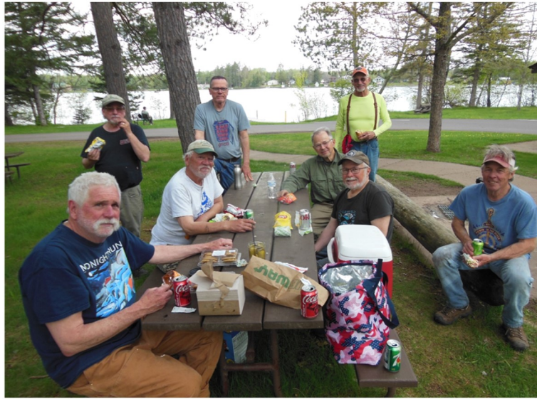
Volunteer crew at lunch

Before our restoration work, spring waters from the pond completely evaporated from the four very large beaver pond