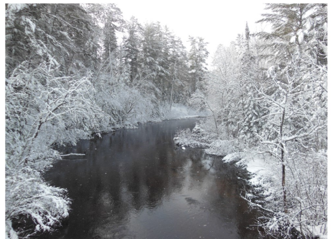
Winter on the Brule

The Club also played a major role in the Family Fun Day event held at the Brule Fish Hatchery in August. Turnout for this year's event was very good as we welcomed 293 people. Our Club had 13 members helping with a half dozen of