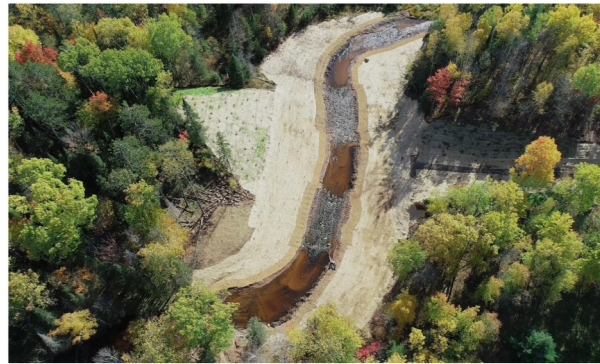
South Shore grade looking south.

It was a very busy and rewarding year to be a part of the Brule River Sportsmen's Club! Thanks to all our members who support our efforts to protect and enhance the river and its fishery.