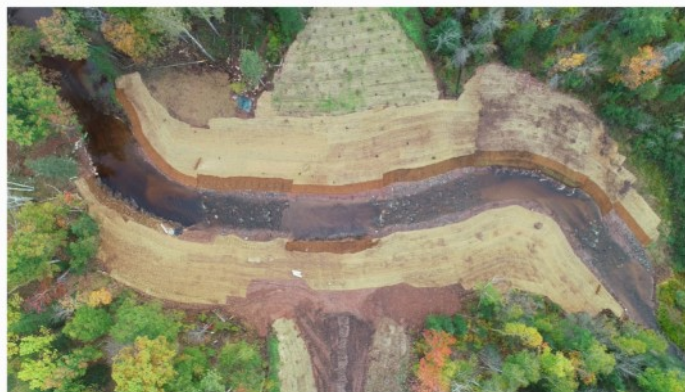
Project Area (stream runs right to left)

Leaving this 12-foot diameter concrete culvert and its nearly 40-foot grade on Nebagamon Creek would have been a huge continuing issue. The biggest threat beyond the rail grades material being eroded into the stream would have been if the failing culvert were plugged with debris, it