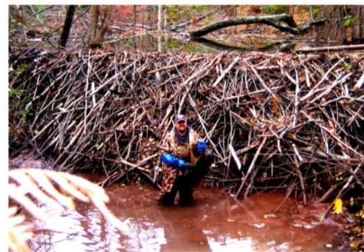
Jerry removes a problem beaver on one of our Lake Superior tributaries.

Our Wisconsin APHIS program is funded with your