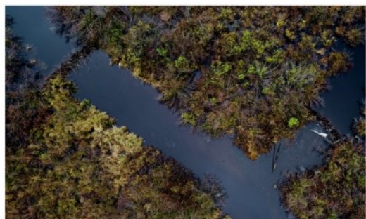
Drone photo of Jerry's last problem beaver dams on the Brule and at the mouth of Angel Creek.