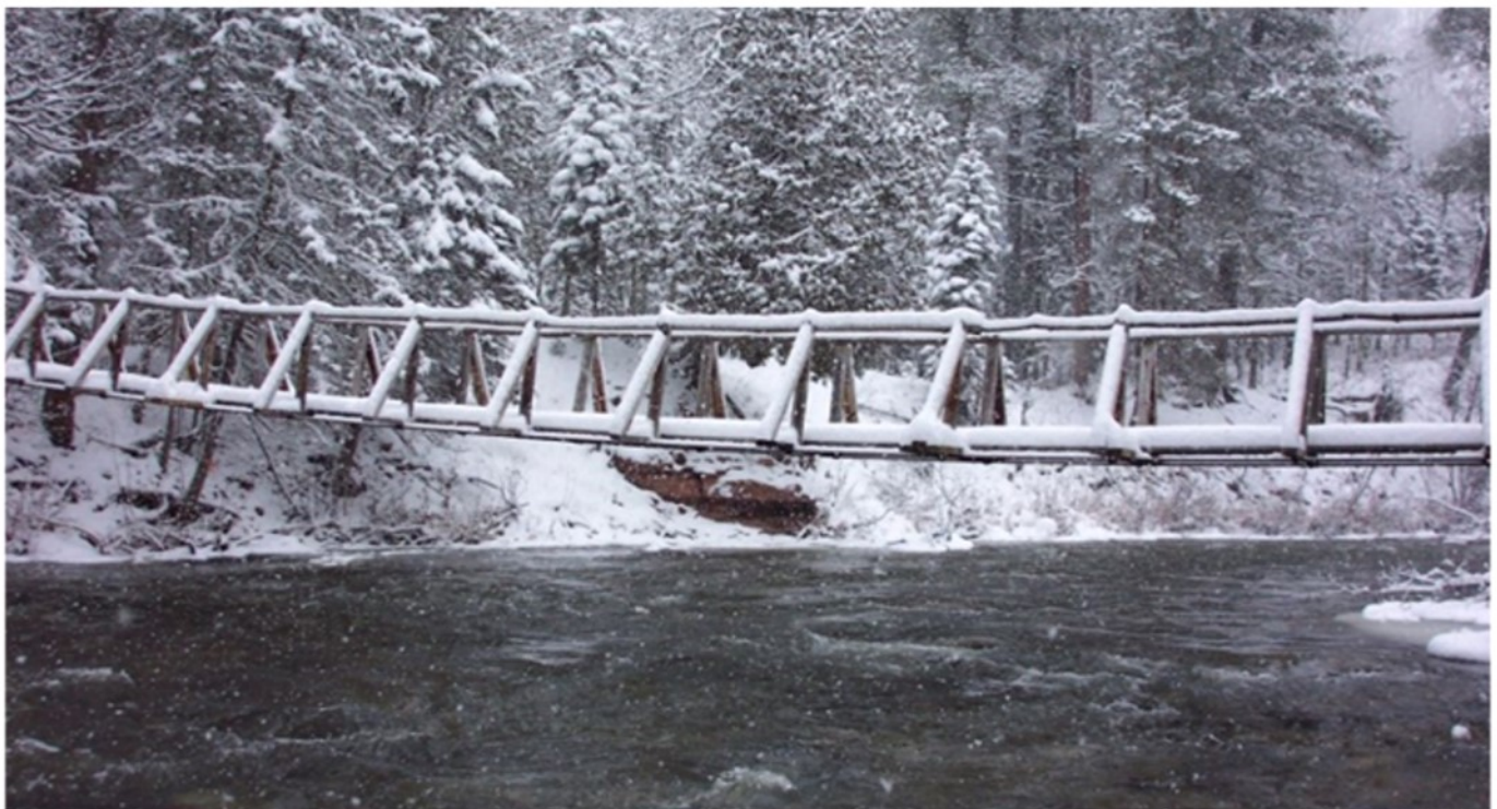
The swinging bridge on the Brule.

The business meeting adjourned at 7:25 p.m.